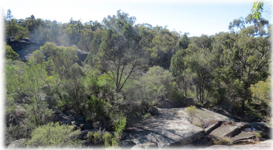
Cannon Creek Gorge