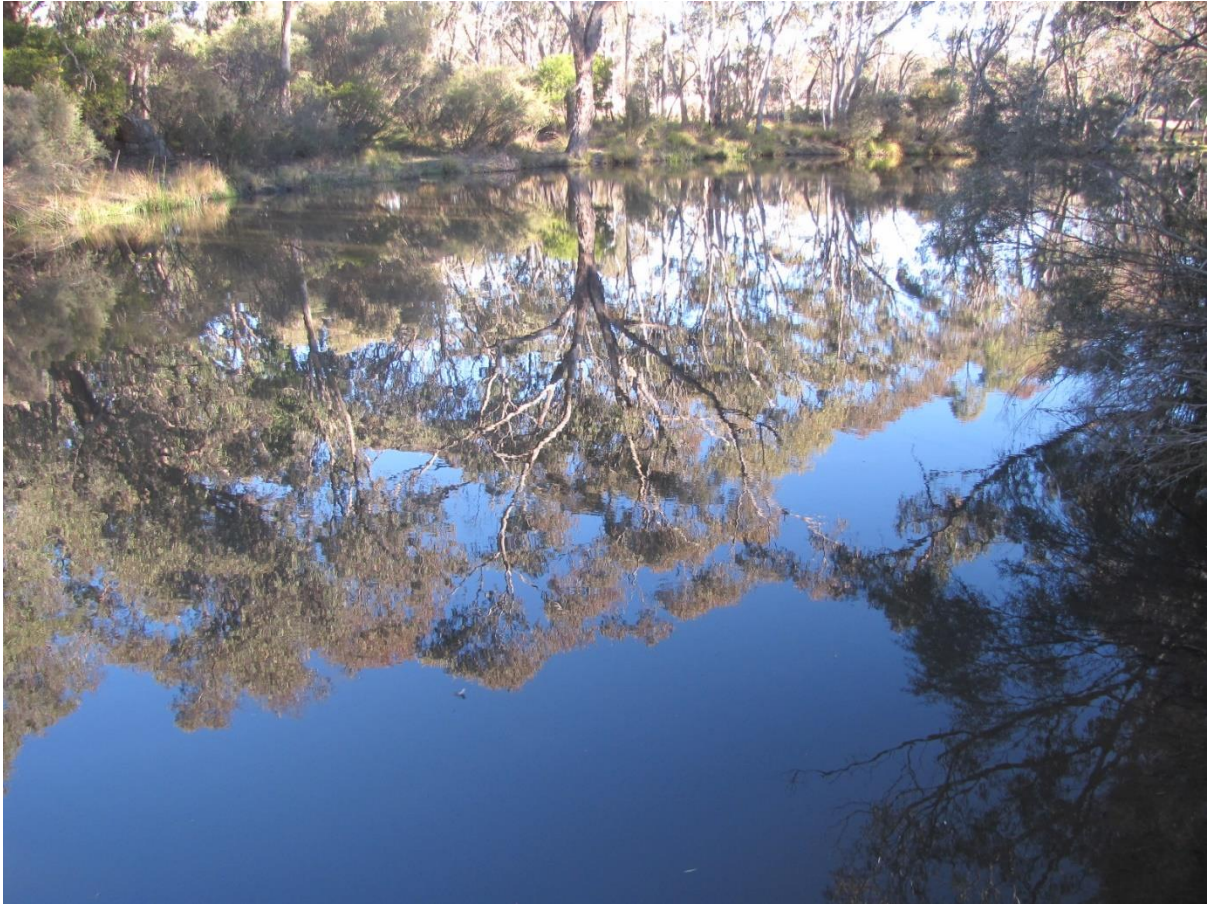
Doro's Hole reflections

Guided walks need to be planned and booked ahead so that I can ensure I am available. I thoroughly enjoy taking people for walks around the property and if I can do it then I definitely will but my time is sometimes spread thin. When making a booking please include an indication of the date & time during your stay at Earth & Soul that you have available for a walk and which walk you would like to do. I will confirm or make an alternative suggestion.