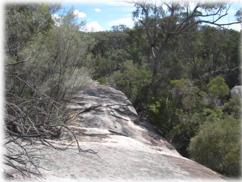
The Dragon's Backbone

The walk to the Dragon's Backbone can be extended to include the area of the Lower Broadwater and then through to Doro's Hole, returning via either Cannon Creek Gorge or the Ridge Walk. The extended walk can take up a morning or afternoon session of 3 to 5 hours.