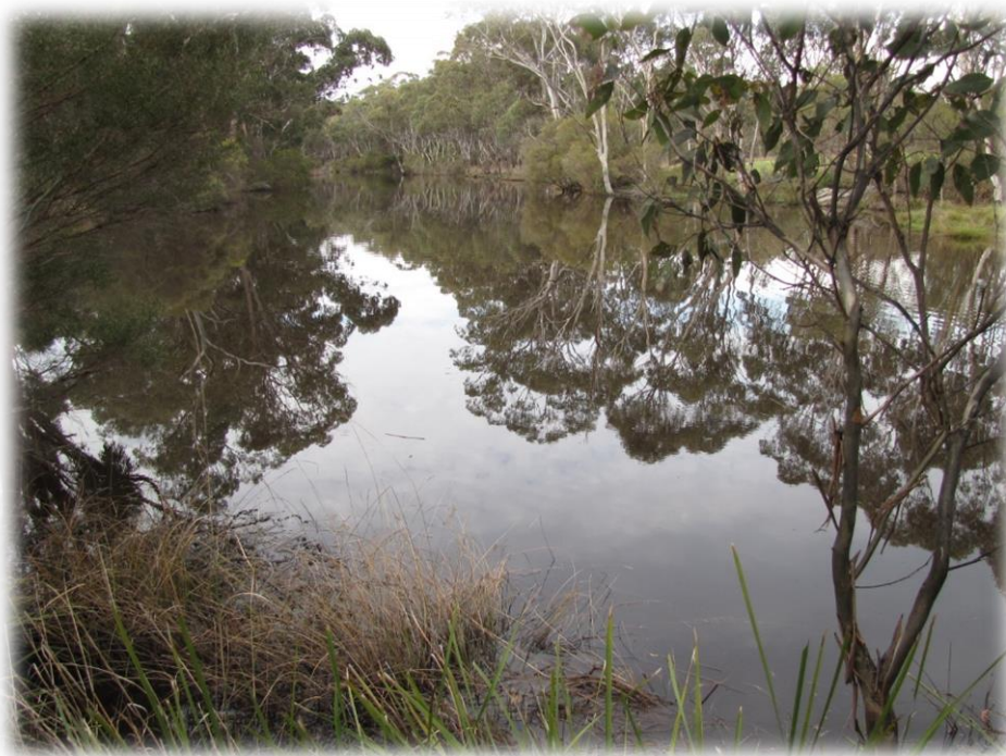
Doro's Hole on the Broadwater

Doro's Hole is always a good inclusion whether for kayaking or just enjoying the scenery. Depending on the season you never know what may be there to discover.